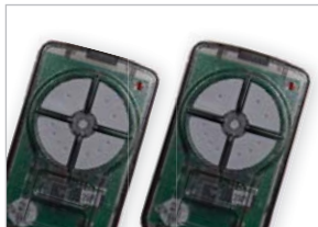
Two TrioCode™128 transmitters